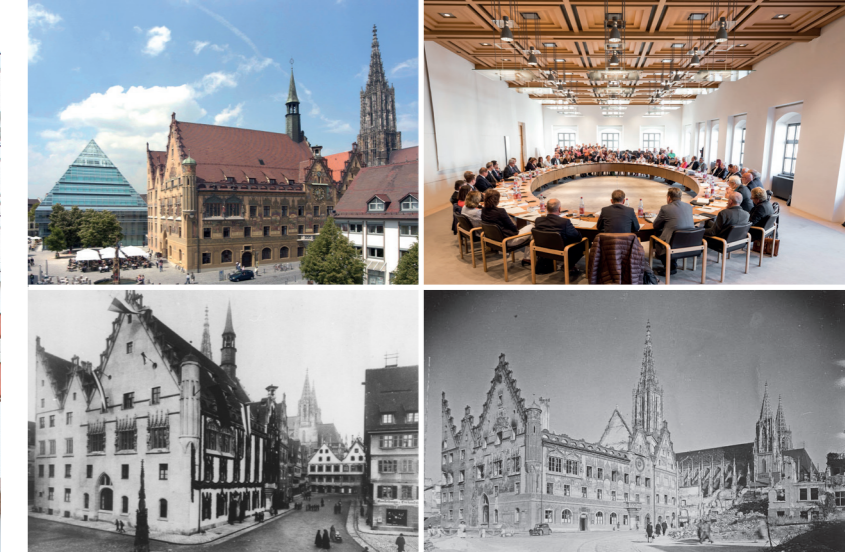
Public library, town hall, minster tower / The council chamber is a place for discussions and decisions. / The south and east sides in 1905 / The south and east sides in 1945 after a bombing raid.